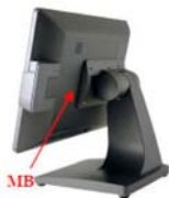
MB Intel Dual Core Pineview D525 Integrated in the back of monitor.