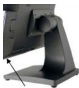
HDD/SSD HDD/SSD hidden at the back, easy for maintenance.