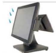
Waterproof at front panel.