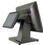
Fanless Design & 8.4" for 2 nd display (viewing angle can be adjusted afreely).