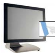
Elegant design with 5 wires resistive or projective capacitive touch.