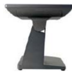
Viewing angle up to 90 degrees.