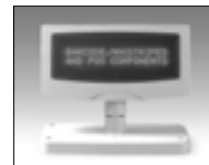
DSP-B03 Optional Short Pole Base