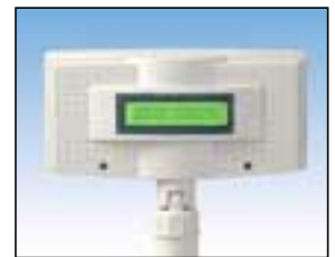
Optional Back LCD